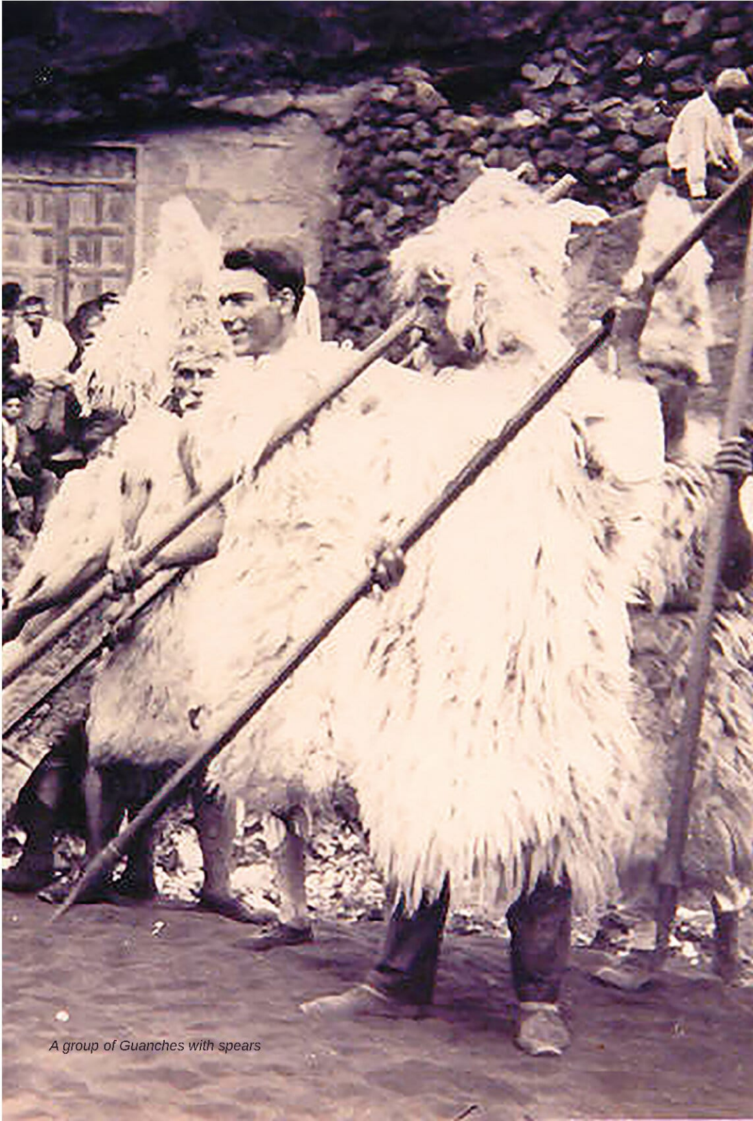
A group of Guanches with spears

The Guanche Ceremony is an ancient ritual celebrated yearly on 14 August at sunset. It begins indoors, as Our Lady of Candelaria leads a procession to the outside of her Basilica. Once there, a local group known as Colectivo Guanches de Candelaria re-enacts the discovery of her image, which took place before the conquest of Tenerife.