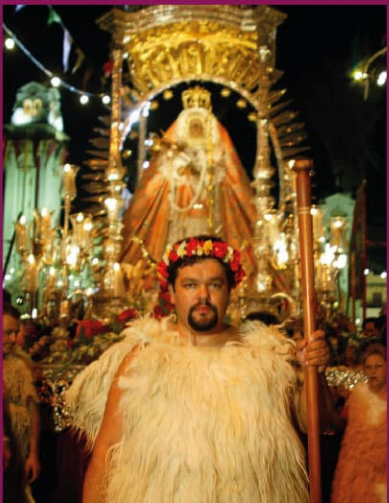
Image of Our Lady at the beginning of the night procession, escorted by some Guanches

The Guanches move the image to Chinguaro, the Mencey of Guimar's auchón,- cave home-, in order to accommodate her there. He carries her with his own hands while the other Guanches guard her on the way. While advancing, they blow their bucios to pay her the highest tributes.