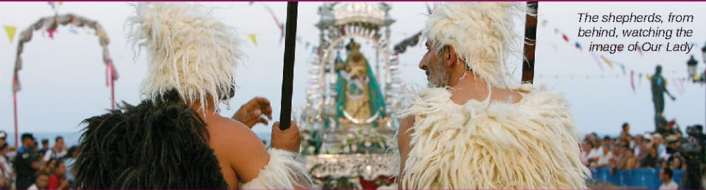
The shepherds, from behind, watching the image of Our Lady

As two Guanche shepherds lead their cattle along the shore, they suddenly notice that their now scared livestock refuse to carry on. They are surprised to find on a stone the figure of a strange woman with a child in her arms. As it was forbidden by law to talk to a woman in a deserted place, the shepherds make her signs to move aside, but she stands still ignoring their gestures.