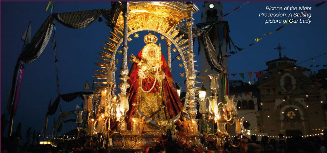
Picture of the Night Procession. A Striking picture of Our Lady

The Night Procession is the epilogue of the Ceremony, during which the image of Our Lady is carried through the local streets with the greatest honours. At around midnight, the Lady of Candelaria returns to her sanctuary, where the Guanches kneel before her and bid her farewell with joy and devotion.