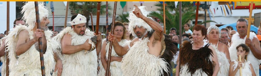
The Mencey talking about the image with his people

In spite of his attempts to communicate, the woman does neither respond nor move, to his greater amazement. The Mencey becomes aware of her majestic figure and therefore decides to move her to his dwellings. However, he is afraid of her and dares neither come near nor touch her. For this reason, he orders the two shepherds to carry the figure. Terrified, they move closer and touch the woman, being miraculously healed over their wounds.