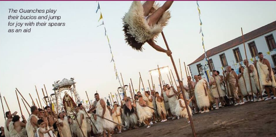
The Guanches play their bucios and jump for joy with their spears as an aid

The Mencey understands that she is endowed with unearthly powers, and commands that only he and his people are to come near her, to carry her themselves. Due to the discovery, the Guanches jump for joy with their spears as an aid and play their bucios, - conches-, in honour of the image.