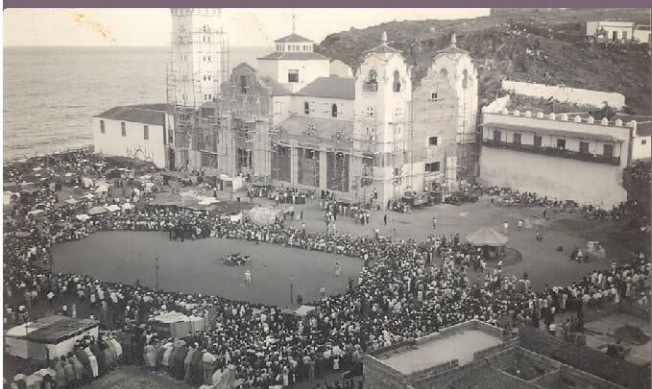
Black and white picture of the 1940s. The sandy area during the performance

The "Ceremonia Guanche", as it is widely known, was the first religious-festive dramatization in the Canary Islands, presenting the historic memory of both the former inhabitants of the Archipelago and that of their descendants. Although we know it dates back at least to the eighteenth century, there is no information as to how and when it was first performed.